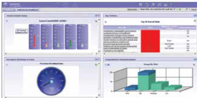
TeamCentral - Dashboard view